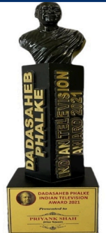
DADA SAHEB PHALKE AWARD