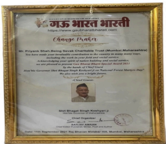
GURU BHARAT BHARTI AWARD