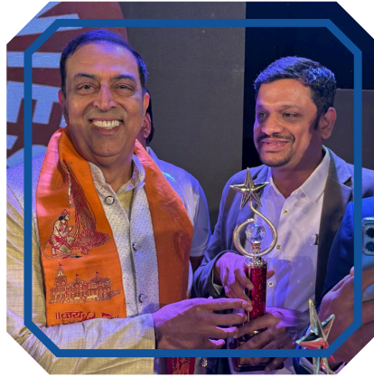
Vindu Dara Singh