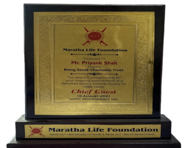
MARATHA LIFE FOUNDATION