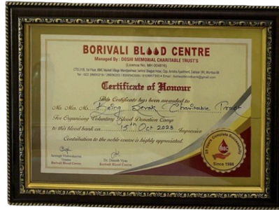
BORIVALI BLOOD CENTRE AWARD