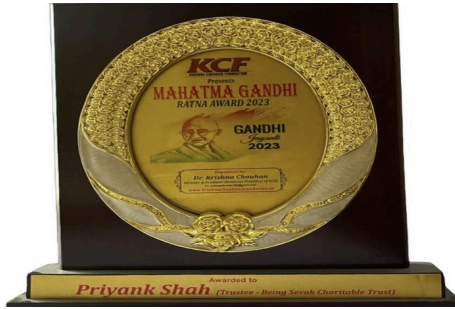
MAHATMA GANDHI RATNA AWARD