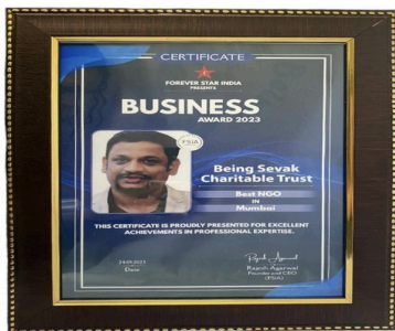
BUSINESS AWARD 2023