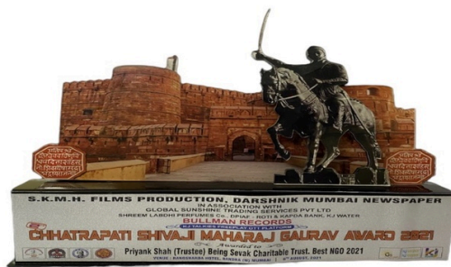
CHHATRAPATISHIVAJI MAHARAJ GAURAV AWARD 2021