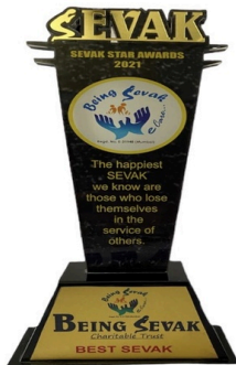
SEVAK STAR AWARD