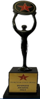
BUSINESS AWARD 2023