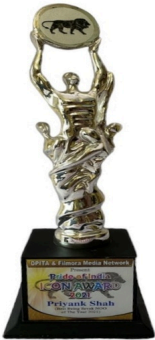
PRIDE OF INDIA ICON AWARD